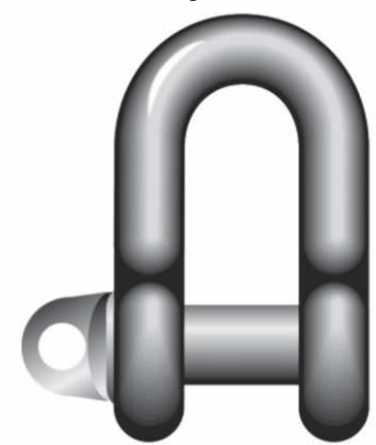
Large Dee Shackle

Due to our policy of continual product development, dimensions, weights and specifications may change without prior notice. Please check with your sales representative when ordering.