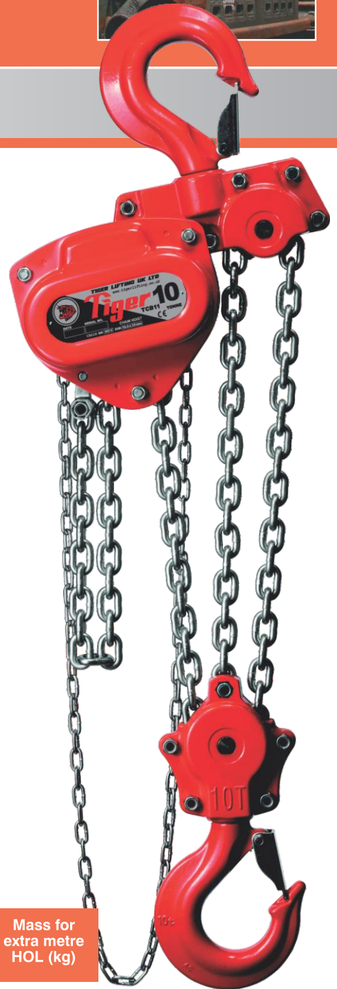
Shown with optional corrosion resistant load chain.

The fine tolerance deep pockets on the hand wheel ensure positive engagement of the hand chain at all times for smooth operation. Overload protection available.